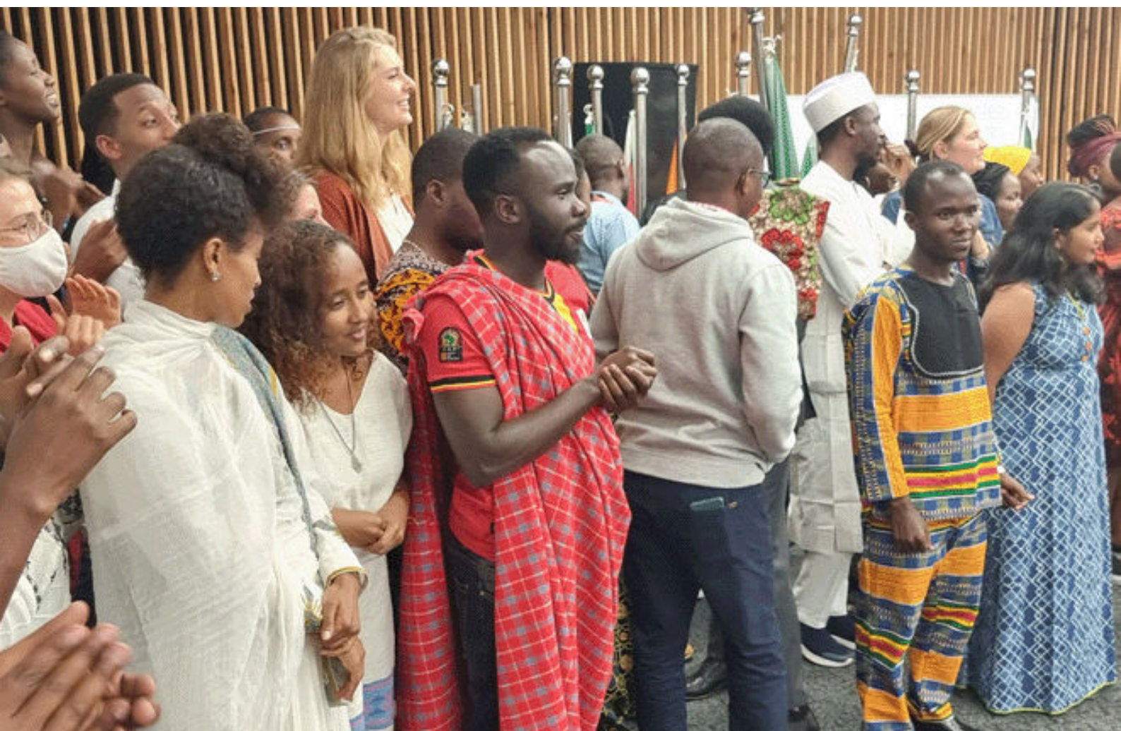
Culture Day celebration on campus, featuring students' traditional dress