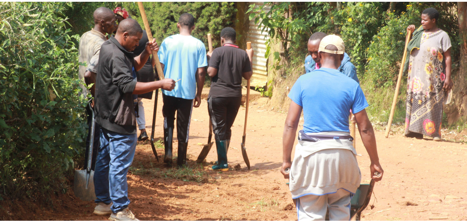
UGHE community members participate in Umuganda