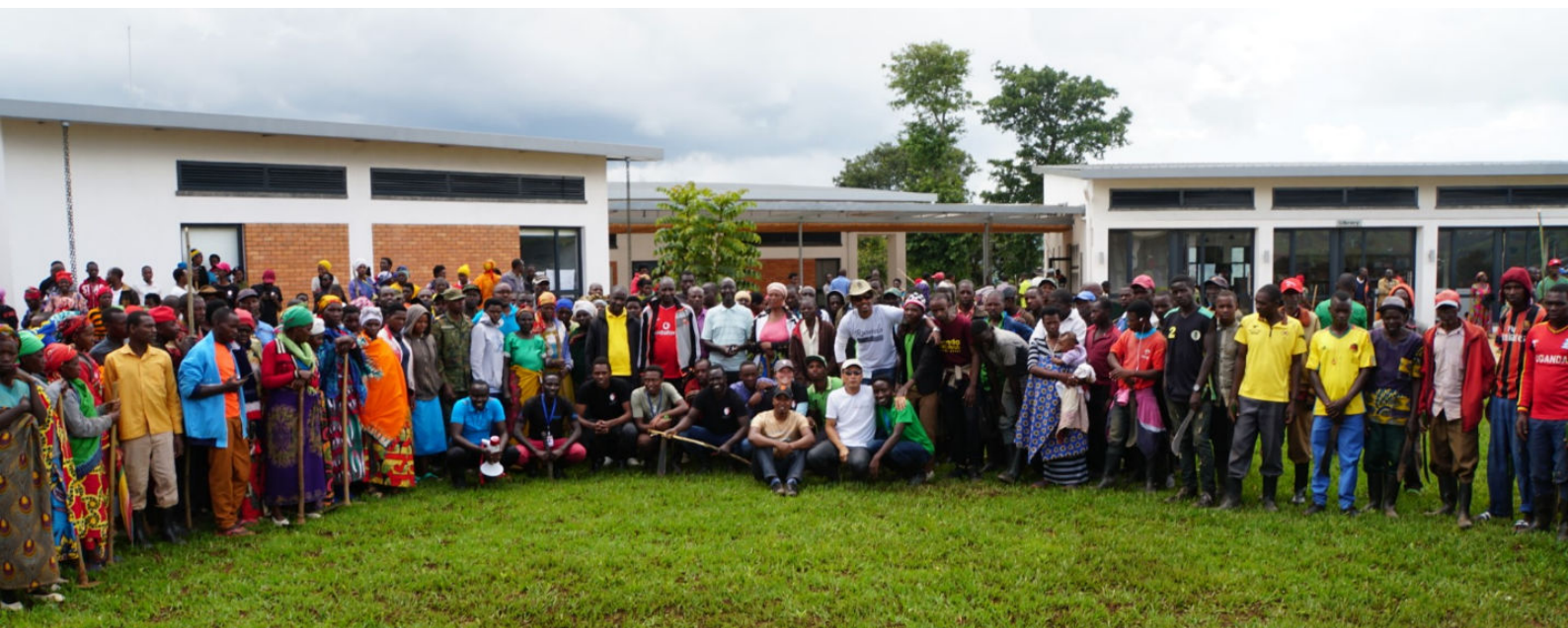
Local community residents and the campus gather in celebration of Umuganda

Umuganda, also translated as ‘coming together in common purpose to achieve an outcome’ was started the period immediately after independence in 1962, organized under special circumstances and was considered as an individual contribution to nation building. It was often referred to as umubyizi , meaning ‘a day set aside by friends and family to help each other’. It became an official government program in 1974 organized regularly once a week with the Ministry of District Development in charge of overseeing it. Umuganda, also known as community work with the purpose to contribute to the overall national development, was reintroduced to Rwandan life in 1998 as part of efforts to rebuild the country after the 1994 Genocide against the Tutsi. Today, it takes place on the last Saturday morning of each month and lasts for at least three hours. Read more about Umuganda: https://www.allaboutrwanda.com/umuganda.html