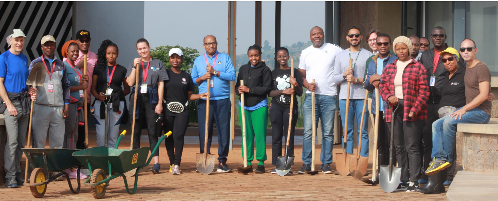
Students, staff and faculty gather for Umuganda

Umuganda, also translated as ‘coming together in common purpose to achieve an outcome’ was started the period immediately after independence in 1962, organized under special circumstances and was considered as an individual contribution to nation building. It was often referred to as umubyizi , meaning ‘a day set aside by friends and family to help each other’. It became an official government program in 1974 organized regularly once a week with the Ministry of District Development in charge of overseeing it. Umuganda, also known as community work with the purpose to contribute to the overall national development, was reintroduced to Rwandan life in 1998 as part of efforts to rebuild the country after the 1994 Genocide against the Tutsi. Today, it takes place on the last Saturday morning of each month and lasts for at least three hours. Read more about Umuganda: https://www.allaboutrwanda.com/umuganda.html