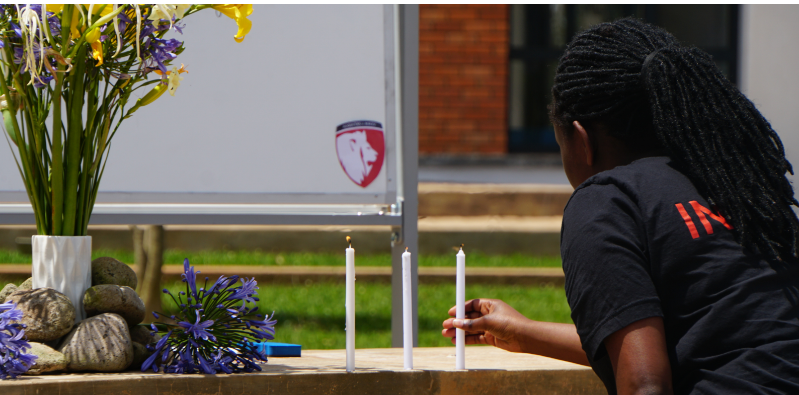
A student lights a candle in remembrance during campus Commemoration activities