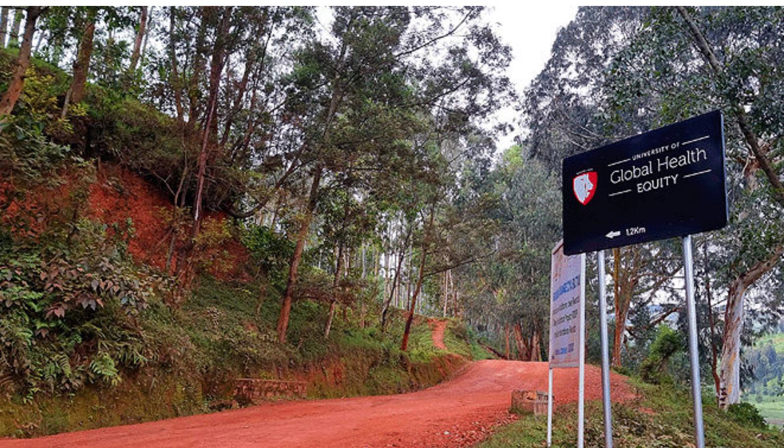
Indigenous trees surround UGHE's campus in Butaro, Northern Rwanda

In its ongoing campus development plans, UGHE prioritizes the preservation of native trees and incorporates indigenous architectural features. By planting and conserving trees such as umuvumu , umuko , and umugote , UGHE not only contributes to environmental sustainability but also honors the cultural significance of these species. For instance, umuvumu trees on campus, like the one in the middle of Butaro Hospital, represents the preservation of Nyabingi and Abagirwa rituals (Ancient Rwandan beliefs and myths). Furthermore, the incorporation of local architectural elements, such as geometric designs inspired by Imigongo paintings, reflects UGHE's commitment to integrating African heritage into its physical infrastructure. Read more about UGHE's Imigongo patterns: https://ughe.org/rwandas-tradition-comes-to-life-on-ughes-butaro-campus/nggallery/image/basangira-edited/