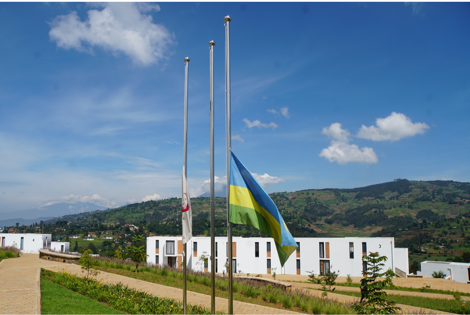
UGHE's campus, Commemoration Week

Every April, UGHE participates in the national commemoration of the 1994 Genocide against the Tutsi. There is a national period of mourning during which commemoration events happen at all institutions and organizations. Each year, UGHE organizes a commemoration event on campus for all staff, faculty and students, inviting a guest speaker to hold a commemoration lecture, visits to memorial sites and fundraising drives for survivors. This commitment to remembering and honoring the victims of the 1994 Genocide against the Tutsi is a critical and tangible way to ensure the history of Rwanda is preserved. It also serves to educate UGHE's national and international community about Rwanda's history, and how every part of Rwandan society and culture has been shaped by the events of the past.